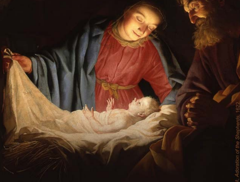
Art: Gerard van Honthorst, Adoration of the Shepherds, 1622.