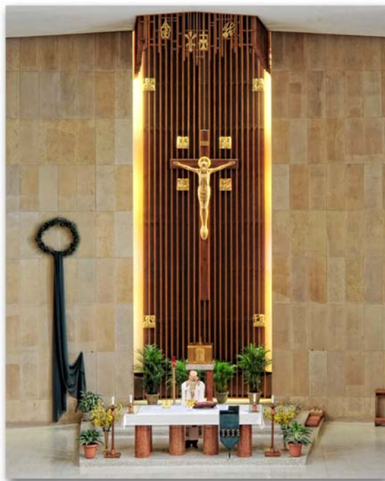
~ BEST PLACE TO WORSHIP ~ Immaculate Conception Church

2018 Sun Focus Newspaper Columbia Heights/Fridley Readers' Choice Awards