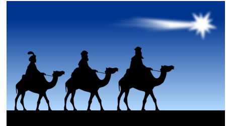
Come, let us adore Him!

Join us to celebrate the graduation of our high school seniors. Graduating students, be watching for a mailing in May with details on the graduation mass.