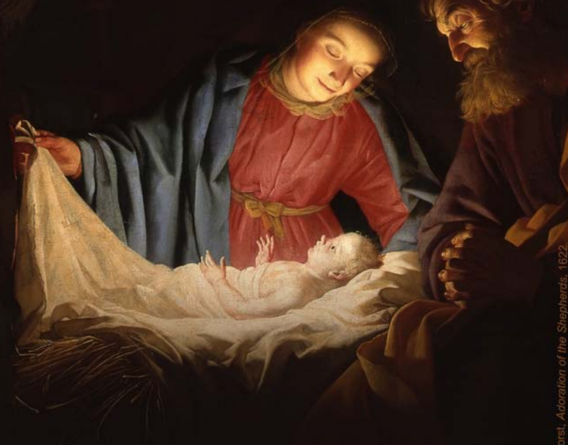
Art: Gerard van Honthorst, Adoration of the Shepherds, 1622.